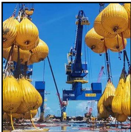
Load Testing Water Bag